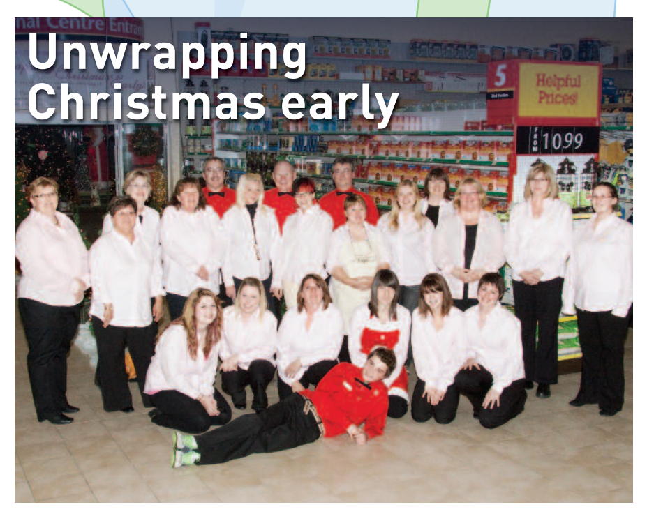
Renfrew Home Hardware officially unveiled Christmas on October 19, 2010. Proceeds of ticket sales from the event, totaling more than $2,000.00, were directed to the Mammography Unit at RVH.