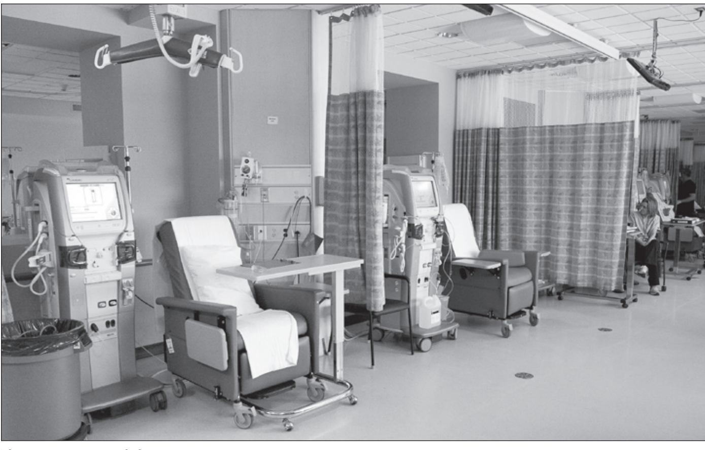
The current 14-station dialysis unit at RVH.

RVH also offers a Peritoneal Dialysis (PD) program that provides telemedicine consultation and services to patients who choose home care treatments.